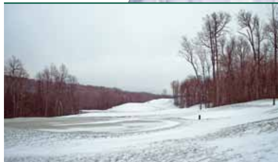
While Champion Hills Country Club's ninth hole looks bleak and foreboding now, golfers are already counting the days until play begins in the spring. Happy days are ahead as paddle tennis courts and a swimming pool are added to the list of amenities already enjoyed by our members.